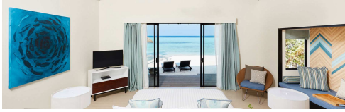
Beach Villa (95sqm)