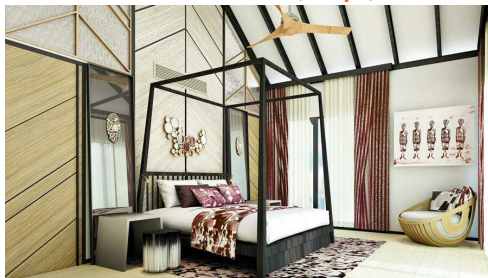
Over Water Villa (77sqm)